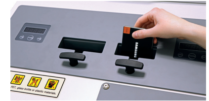
Fig. 2b Laptop drive infeed