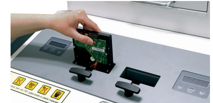
Fig. 2a Desktop drive infeed