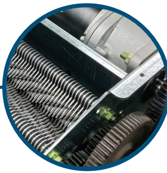
Commercial Grade Heat-treated solid steel cutting blades, all metal gears, AC geared motor