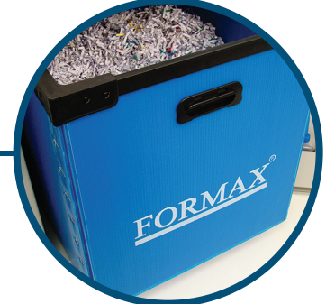
Durable Waste Bin Lifetime guaranteed rugged molded plastic for durability