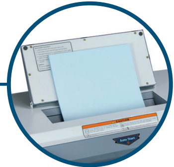
AutoFeed Hopper Infeed Holds up to 175 sheets for convenient, unattended shredding