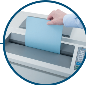
Standard Infeed Hand-feeding slot accommodates up to 24 sheets