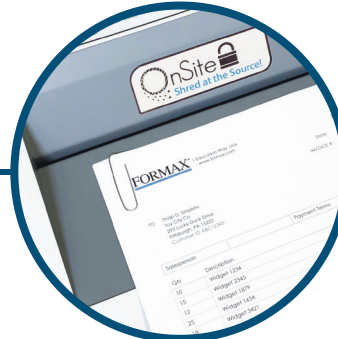
Staples, Paper Clips & Credit Cards Solid steel cutting blades handle staples, paper clips, and credit cards