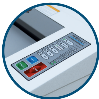
User-friendly Control Panel Auto Start/Stop/Reverse, Full Bin Indicator, Load Indicator

The FD 8400HS High Security Office Shredder offers P-7 security with commercial-grade components in a sleek office design. Evaluated by the NSA to meet the requirements of NSA/CSS specification 02-01 for P-7 high security cross-cut shredders, its continuous-duty motor shreds up to 23 feet per minute , with a shred size of 1/32" x 3/16" . Commercial-grade features include heat-treated steel blades , a steel cabinet on casters , lifetime guaranteed waste bin , energy-saving ECO mode , and a user-friendly LED control panel . The optional EvenFlow™ Automatic Internal Oiling System helps to keep the FD 8400HS in peak operating condition.