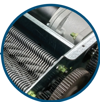
Commercial Grade Heat-treated solid steel cutting blades, all metal gears, & an AC geared motor