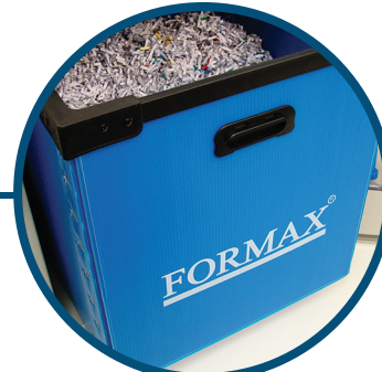
Durable Waste Bin Lifetime guaranteed rugged molded plastic for durability