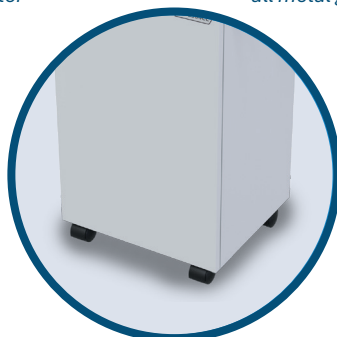
Rugged All-Metal Cabinet Includes casters for mobility