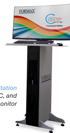
Optional CCS8 Command Station Workstation, PC, and 32" curved monitor