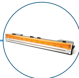
Memjet® Inkjet Print Head Stationary print head for higher speeds, lower ink use, and less noise