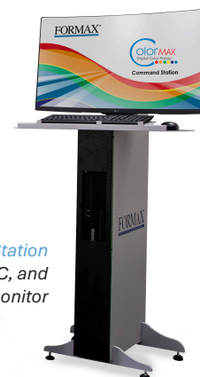
Optional CCS8 Command Station Workstation, PC, and 32" curved monitor