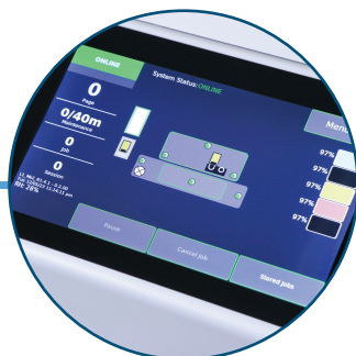
Intuitive 7" Color Touchscreen Displays system status, image preview, and access to 60 GB of stored jobs