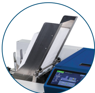
Top-Loading Feed System Holds up to 575 #10 envelopes, and media up to 10.5" x 17"

The ColorMax8 Digital Color Printer utilizes the latest inkjet technology to produce full-bleed, full-color mailing and packaging solutions with a class-leading low cost per piece. The wide, flat paper path allows users to print on a variety of materials up to 3/8" thick including stuffed envelopes. Its intuitive 7" color touchscreen provides greater control over the entire process including image preview, system status , and access to up to 60 GB of stored print jobs . Thermal inkjet technology allows for printing on pre-printed and windowed envelopes , and its high-capacity ink tanks are easily accessible from the front of the printer.