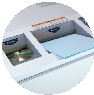
Dedicated Paper & CD Infeeds Separate feed and waste bins for easy disposal of paper and CD's