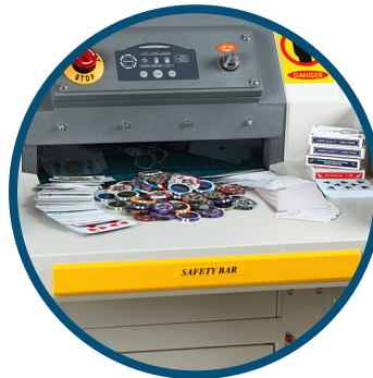
Conveyor Feeding System Allows for shredding up to 650 lbs of playing cards per hour