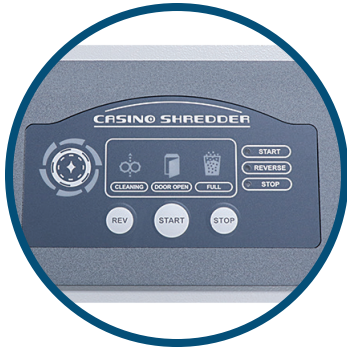
User-Friendly LED Control Panel Auto reverse/stop, auto cleaning, and door open/bin full

In the casino and gaming industry, security is a top priority. Reduce the risk of fraud with the FD 87 Casino EX Conveyor Shredder , which combines user-friendly features, industrial strength and video accountability. Solid-steel cutting blades and a heavy-duty 3HP motor shred entire decks of playing cards, dice, casino chips, and gaming tokens. Simply press Start on the LED Control Panel , load items onto the conveyor, then monitor the shredding process with the unique Camera Monitoring System that displays and records real-time video of the feeding and destruction of retired gaming pieces. Shredded particles are collected in the rugged molded plastic waste bin for secure disposal.