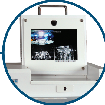
Camera Monitoring System Four camera angles provide live monitoring and recording