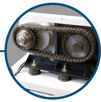
Rugged Chain-Driven Motor 3HP motor powers through cards, dice, casino chips, and tokens