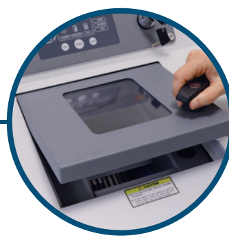
Enclosed Shredding Chamber Plexiglas cover allows for safe viewing of game piece destruction