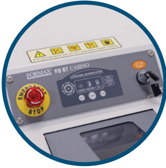
User-Friendly Control Panel LED indicators, key lock, large emergency stop button

In the casino and gaming industry, security is a top priority, both on the gaming floor and behind the scenes. Reduce the risk of fraud with the FD 87 Casino Shredder . This specially-designed unit combines user-friendly features with the industrial strength needed to ensure retired gaming pieces stay out of the wrong hands. Solid-steel cutting blades and a heavy-duty motor shred entire decks of playing cards, multiple dice, casino chips, and gaming tokens . Simply open the enclosed shredding chamber , drop in the items, close the latch, and press Start on the LED Control Panel . Shredded particles are then collected in the rugged molded plastic waste bin for secure disposal.