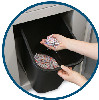
Front-Access Waste Bin Shredder can be placed against a wall to save space