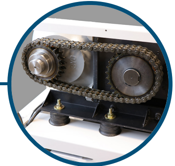
Chain-Driven AC-Geared Motor Can shred 3 decks of cards, 20 dice, or 40 casino chips per cycle