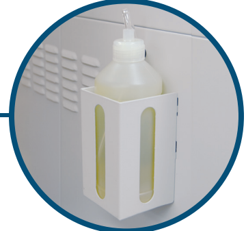
Automatic Oiling System EvenFlow™ Automatic Oiling System lubricates blades for peak performance