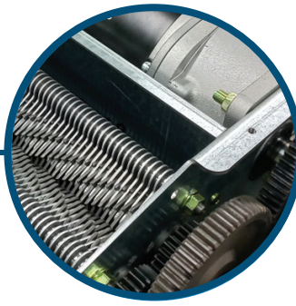
Commercial Grade Heat-treated solid steel cutting blades, all metal gears, AC geared motor