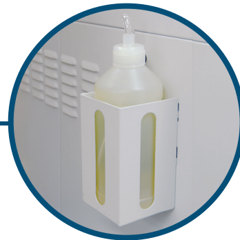
Optional Oiling System EvenFlow™ Automatic Oiling System lubricates blades for peak performance