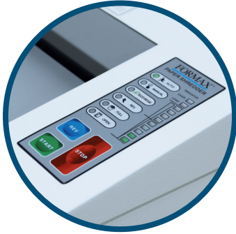
Easy-to-Use Control Panel Auto, Reverse, Bin Full Indicator, Load Indicator, ECO Mode

The FD 8402CC Office Shredder is built to the highest standards for convenience, safety, and reliability. This cross-cut model features an easy-to-use LED control panel which puts commercial-grade power right at your fingertips. Heat-treated steel blades , an all-metal cabinet with casters , lifetime guaranteed waste bin , ECO mode , and a powerful AC geared-motor ensure years of reliable performance. The optional EvenFlow™ Automatic Oiling System helps to keep the FD 8402CC in peak operating condition.