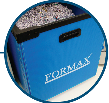
Durable Waste Bin Lifetime guaranteed rugged molded plastic for durability