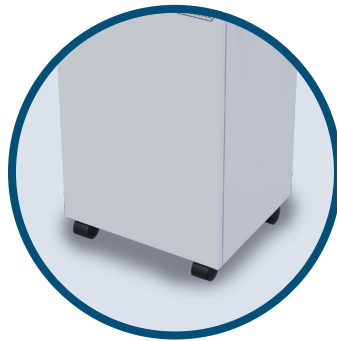
Rugged All-Metal Cabinet Includes casters for mobility