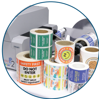
Compatible Across Substrates Works easily with paper, polyester, polypropylene and vinyl label stocks