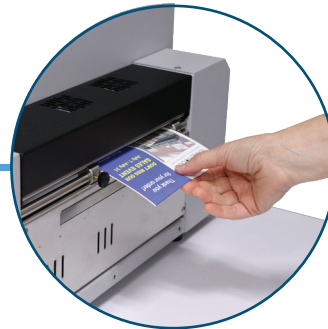
Two Operating Modes Continuous roll-to-roll for production, integrated cutter for short-run jobs