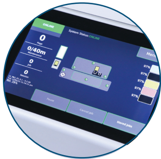
Color Touchscreen Control Panel Recall stored jobs, monitor status, check ink levels, perform maintenance operations

The ColorMaxLP3 produces brilliant full-color labels from a compact on-demand unit. Its high-speed standard Unwinder/Rewinder System easily handles a variety of substrates for continuous roll-to-roll production at up to 60 fpm. The Memjet® print head features 70,400 inkjet nozzles for print resolution up to 1600 x 1600 dpi . High-capacity 250ml ink tanks allow for longer uninterrupted print runs. User-friendly features include an intuitive 7" color touchscreen with job storage, 10-second warm start , and front access to ink cartridges .