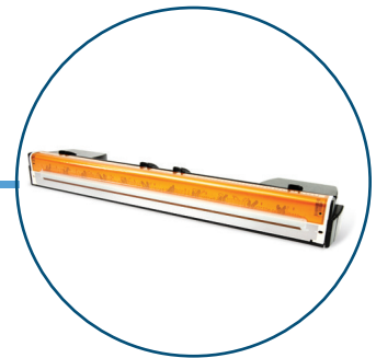
Memjet® Inkjet Print Head Stationary print head with no moving parts features 70,400 inkjet nozzles