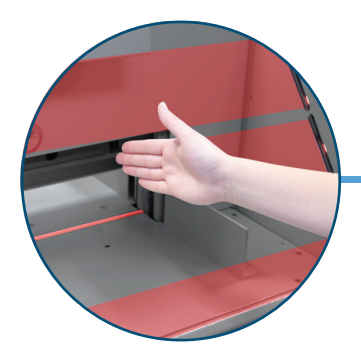
Infrared LED Safety Curtain Immediately stops operation if the light beam is broken

The Formax Cut-True 28A Paper Cutter brings operators time and cost savings with its easy to use programmable touchscreen and automatic operation. It's 18.9" cutting area, standard 110 volt power, safety systems, and precision cutting makes the Cut-true 28A the perfect fit for any on-demand light production print shop or in-plant finishing center.