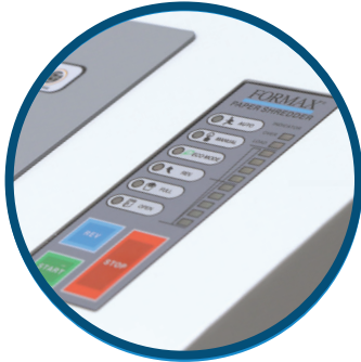
User-Friendly Control Panel: ECO Mode, Door Open Sensor, Reverse, Bin Full Indicator

The Formax FD 87SSD OnSite Multimedia Office Shredder is designed for the modern technological world. It easily shreds mobile phones, SSDs, mini tablets, USBs, and more . The FD 87SSD is whisper-quiet and operates on standard 120V power , making it ideal for the office environment. It features a user-friendly LED control panel , a sturdy all-metal cabinet , solid steel cutting blades , and a rugged chain-driven motor . The separate enclosed infeed options allow users to safely shred a variety of media up to 6.5" wide. With its commercial-grade construction, the FD 87SSD sets the standard for safety and security.