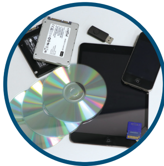
Multimedia Devices: Easily shreds a variety of media from mobile phones to mini tablets