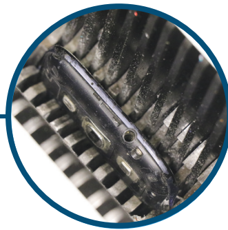
Commercial Grade: Solid-steel heat-treated blades and rugged chain-driven motor