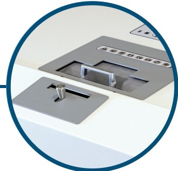
3 Dedicated Infeed Options: Safely feed various size media through the appropriate infeed, up to 6.5" W