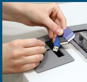
USBs and SD Cards