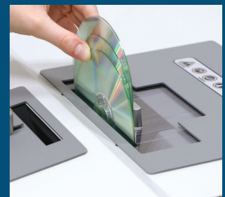
CDs and DVDs