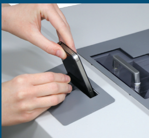
Mobile Phones and SSDs