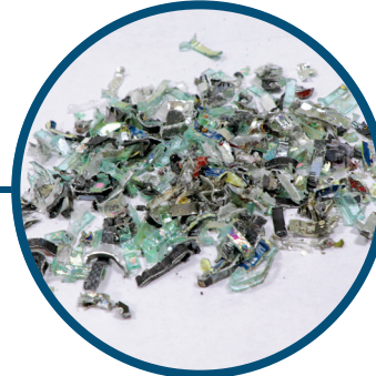
Media Shredding: Shreds media into random pieces up to 0.60". Perfect for security and peace of mind