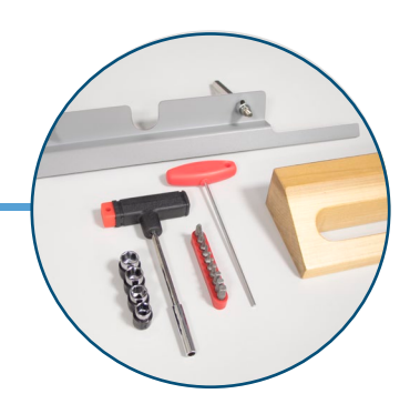
Blade Change Safety Tool Kit Change blades safely and easily, and make adjustments

Manual Back Gauge Adjustment Fine-tune control for precision cutting