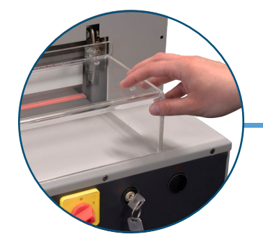
Electronically Controlled Safety Cover Immediately stops operation if the cover is lifted

The Formax Cut-True 23S Electric Paper Cutter offers precision cutting for paper stacks up to 16.9" wide and up to 1.75" high. This semi-automatic cutter requires very little effort, with its electronically-controlled two-button operation, and doesn't sacrifice safety for accuracy. It features an electronically-controlled front safety cover, a safety lock with key, an easy to use blade change safety tool, and a wooden paper push for safe alignment. The Cut-True 23S is ideal for transforming brochures, invitations and more, with crisp, accurate cuts, and is a welcome addition to print shops and in-plant finishing.