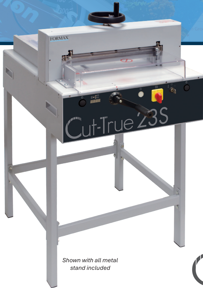
Shown with all metal stand included