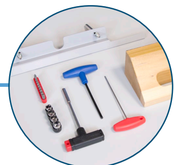
Blade Change Safety Tool Kit Change blades safely and easily, and make adjustments