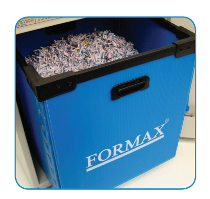
Lifetime guaranteed heavy-duty molded plastic waste bin

Formax - New Hampshire, USA www.formax.com