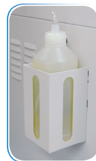
EvenFlow™ Automatic Oiling System

*Capacity varies depending on paper and power supply