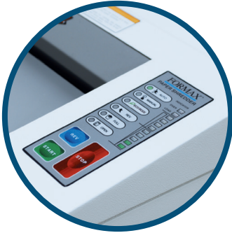
User-friendly Control Panel Auto Start/Stop/Reverse, Full Bin Indicator, Load Indicator

Formax FD 8400HS-1 High Security Office Shredders offer security, combined with commercial-grade components in a sleek, practical design. An easy-to-use LED control panel puts the power right at your fingertips. The FD 8400HS-1 Cross-Cut model can shred up to 8 sheets at a time, up to 23 feet per minute , with a shred size of 1/32" x 3/16" meeting the requirements for P-7 high security cross cut shredders. In addition, the ECO Mode saves energy by automatically switching into standby mode after 5 minutes of inactivity. The EvenFlow™ Automatic Oiling System periodically lubricates the solid-steel cutting blades to keep the FD 8400HS-1 in peak operating condition.