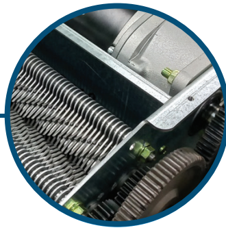
Commercial Grade Heat-treated solid steel cutting blades, all metal gears, & an AC geared motor