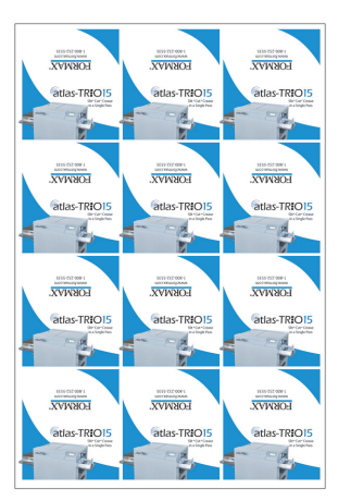
12-up half-fold business cards on 12" x 18" sheet

11" x 17" Sheet: 4-up postcard, single crease ledger