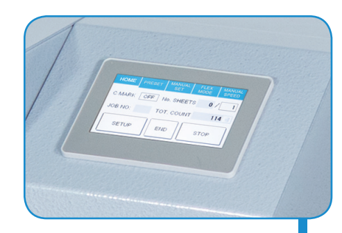
Color touchscreen control panel