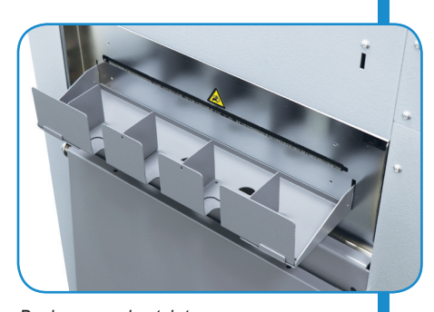
Business card catch tray