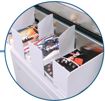
Adjustable Catch Tray Holds finished pieces and keeps them neatly stacked