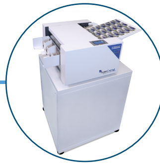
Optional Cabinet with Waste Bin Ideal for higher volume, features casters for easy movement