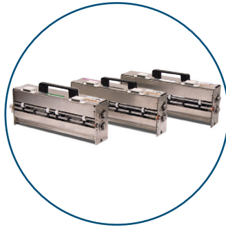
Optional Quick-Change Cassettes Heavy duty cutting cassettes can be changed easily for different size jobs