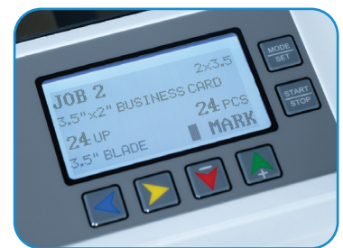
User-friendly LCD control panel