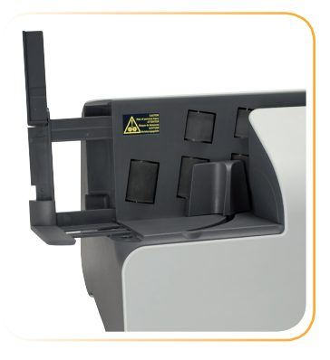
Easy-to-use support arm extends to hold large envelopes

402 Series Envelope Jogger: Two-bin jogger settles contents and prepares envelopes for opening