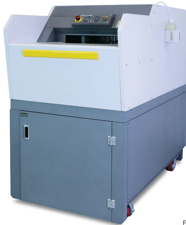
FD 8906B Industrial Shredder