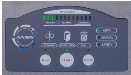
LED control panel with visual load indicator

The FD 8906B offers unmatched automated features through its LED control panel. The easy-to-read Load Indicator assists operators in determining how close they are to the maximum shred capacity to avoid jams and provide optimal efficiency. Operators can select from two modes of operation: Auto Start/Stop or Manual. Auto Start/Stop mode utilizes optical sensors which detect paper and start/stop operation automatically. The Safety Key Lock prevents unauthorized use of the shredder.