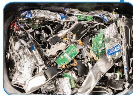
Shredded particles fall into the molded plastic waste bin for easy storage and disposal

Formax - New Hampshire, USA www.formax.com Local Dealer: