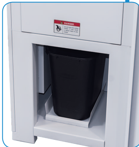
Rugged molded plastic waste bin for convenient storage and disposal