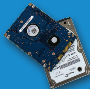
Laptop Hard Drives