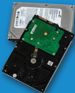
Desktop Hard Drives