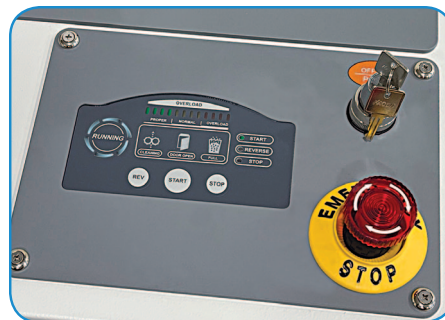
LED control panel, safety key lock and large emergency stop button