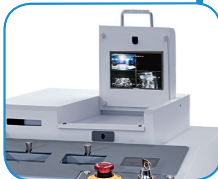
Recording System internal and external cameras to monitor input and output of drives for optimal security

Formax - New Hampshire, USA www.formax.com Local Dealer: