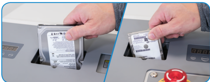
Separate shredding chambers sized for 3.5" HDD and 2.5" SSD & HDD hard drives, each with sliding metal safety shields and resettable LED counters