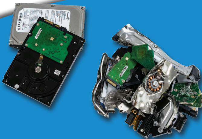
3.5" HDD Hard Drives Shredded with the FD 87HDS-R