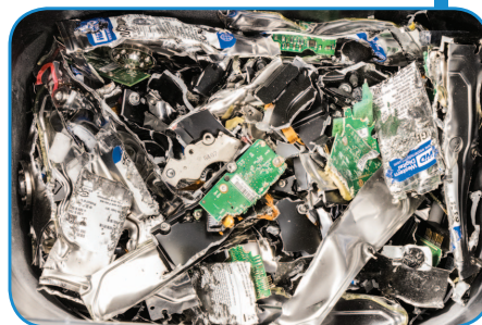
Particles fall into the waste bin for easy storage and disposal