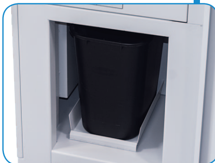
Rugged molded plastic waste bin for convenient storage and disposal