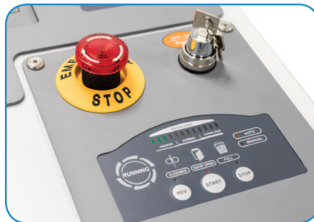
LED control panel, safety key lock and large emergency stop button