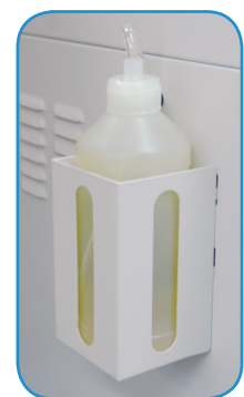
EvenFlow™ Automatic Internal Oiling System

*Capacity varies depending on paper and power supply