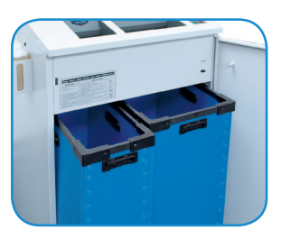
Separate Waste Bins for Paper and Optical Media