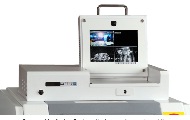
Camera Monitoring System displays and records real-time feeding and destruction of gaming materials.

1-Year Warranty on cutting head and all other parts