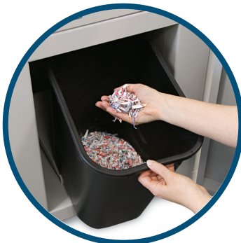
Front-Access Waste Bin Shredder can be placed against a wall to save space