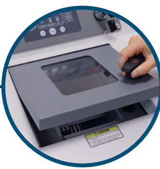
Enclosed Shredding Chamber Plexiglas cover allows for safe viewing of game piece destruction