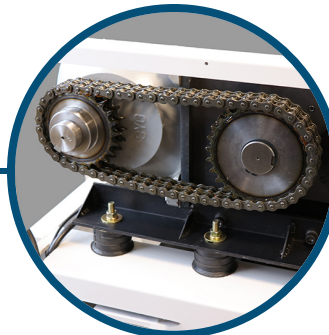
Chain-Driven AC-Geared Motor Can shred 3 decks of cards, 20 dice, or 40 casino chips per cycle