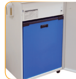
Heavy Duty Waste Bin