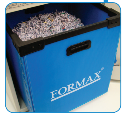
Lifetime Guaranteed Heavy-Duty Waste Bin