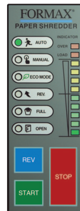
Easy-to-use control panel with Load Indicator and ECO Mode