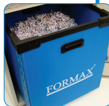
Lifetime Guaranteed Heavy-Duty Waste Bin