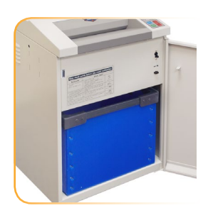
Heavy Duty Waste Bin