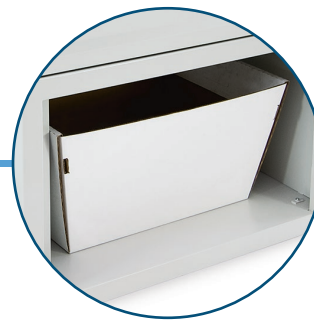
Convenient Waste Bin Access Rugged cardboard bin collects slit pin-feed margins, and is easy to access for emptying