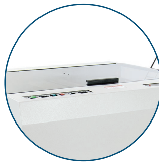
Safety Interlocks Plexi cover allows users to check processing, while safety locks stop the machine if the cover is open