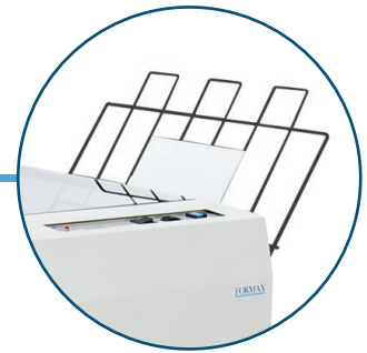
Neat Outfeed Conveyor wheels feed burst forms into a neat stack on the slanted outfeed rack