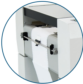
Accurate Feeding Tractor feed and static eliminator ensure accurate feeding

Separate multi-part forms quickly and easily with the FD 676 Industrial Burster . This rugged, all-metal high-volume unit is capable of operating continuously 24/7. It processes continuous forms up to 17" long at speeds up to 500 feet per minute while slitting, separating and stacking the forms. Standard features include slitters, tractor feed, safety interlocks, stand, and a conveyor outfeed.