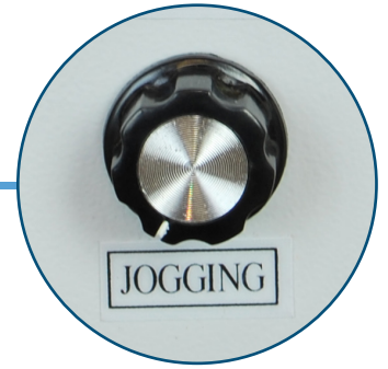
Variable Jog Speed

Up to 29,000 rpm, adjustable for heavy stock