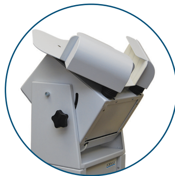
Tilting Jog Bin

Up to 3,000 vibrations per minute, adjustable for heavy stock