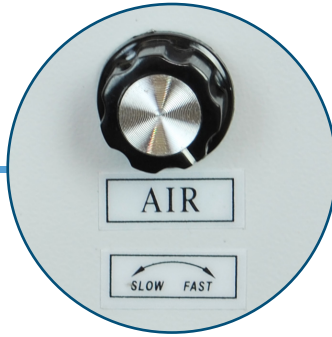
Variable Air Pressure

Set the 60-second countdown timer for accurate unattended jogging