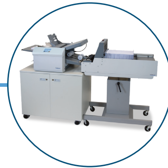
Optional V-Stack36i Vertical Stacker Aligns with outfeed to vertically stack up to 22" of folded documents for further processing