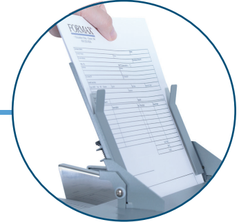
Optional Multi-Sheet Feeder Up to 4 stapled or unstapled sheets can be folded at once