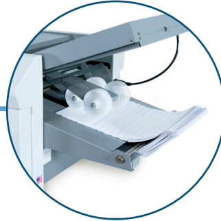
Adjustable Stacker Wheels Neatly stack different paper sizes and fold types