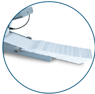
Telescoping Conveyor System Extends from 14" to 36" in length and holds up to 500 folded pieces