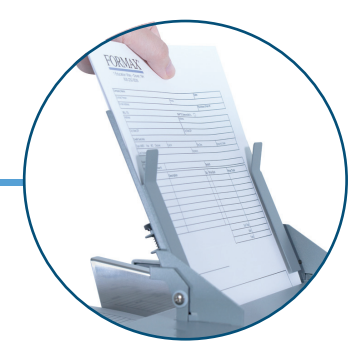
Optional Multi-Sheet Feeder Up to 4 stapled or unstapled sheets can be folded at once

Adjustable Stacker Wheels Neatly stack different paper sizes and fold types