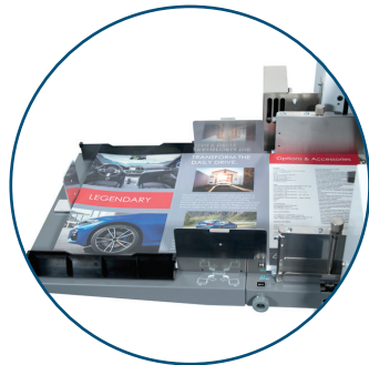
Extended Infeed Tray with Air Suction Handles sheets up to 25.5" long, using both optical and ultrasonic sensors