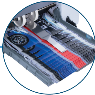
Outfeed Stacking Belt & Rollers Automatically adjusts to paper size, with two tray positions available