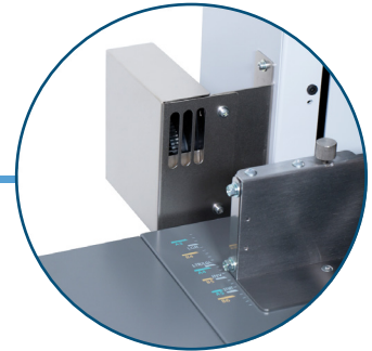
Side Air System Enhances feeding of heavy stock and large paper sizes