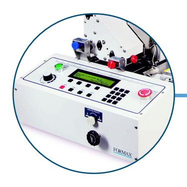
LCD Display Allows for easy set up and operation with up to 4 programmable jobs

The FD 282 Double-Head Edge Tabbing System features revolutionary advances in tabber design. It can apply tabs on opposite sides of the mail piece at the same time, or on top and side in a single pass. The key is the FD 282's combination of tabbing heads : the fixed head applies tabs along an open edge, while the repositionable head can switch from side tabbing to front (leading-edge) tabbing . The flexible head can also affix flat tabs, small labels or up to 3 USPS roll stamps in one pass . The central control panel with LCD display can store up to 4 jobs into memory. The FD 282 processes up to 25,000 pieces per hour (single), 15,000/hour (double) or 10,000/hour (triple), in sizes up to 11" x 15", up to 1/4" thick.