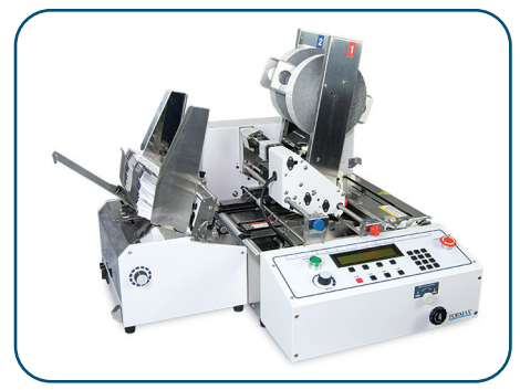
FD 282SF- FD 282 Tabber plus Medium Volume Synchronized Feeder