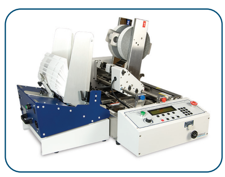
FD 282HF- FD 282 Tabber plus High-Volume Heavy-Duty Friction Feeder