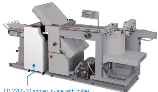
FD 2200-10 shown in-line with folder.