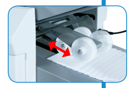
AutoStack™ Stacker Wheels