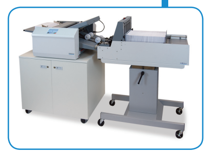
FD 2056 in-line with optional V-Stack36i Vertical Stacker, stand and cabinet