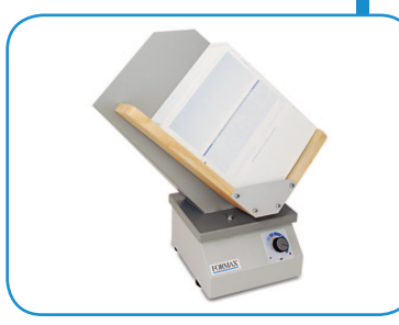
402 Series Jogger - an option which reduces static electricity from forms and aligns them for proper feeding

Formax – New Hampshire, USA www.formax.com