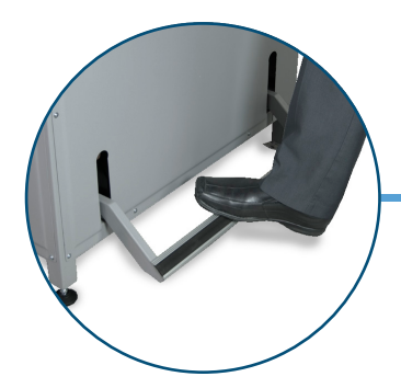
Foot Pedal Pre-Clamp Holds paper in place to check alignment prior to cutting