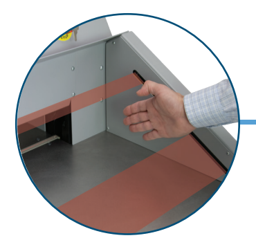
Infrared Light Beam Safety Curtain Immediately stops operation if the beam is interrupted

The Cut-True 31H Hydraulic Guillotine Paper Cutter features a hydraulic blade and clamp drive for true two-shift operation . Rugged heavy-duty construction allows it to handle paper stacks up to 28 " wide and up to 4 " high , with cutting accuracy of 0.1mm. User-friendly features include a color touchscreen , automatically-adjusting back gauge , and up to 100 programmable jobs . The LED cut line , foot pedal pre-clamp , and electronic back gauge switch ensure precision cutting every time. This large-format cutter includes wide side tables , and an anti-friction ball deck with air-assist making it easier to maneuver large paper stock. Safety features include dual-button operation , an infrared safety curtain , key lock , blade lock , automatic blade return , and a blade change safety tool .