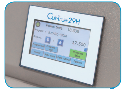
Touchscreen control panel allows for programming up to 100 jobs

* 31"W with safety curtains removed for easier transport through doorways. 33.5"W including safety curtains.