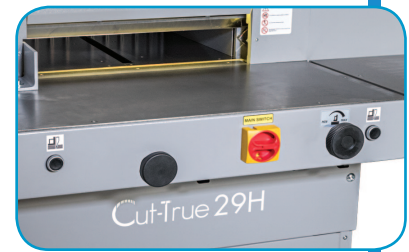
Two-button operation, fine-tune knob, adjustable hydraulic pressure