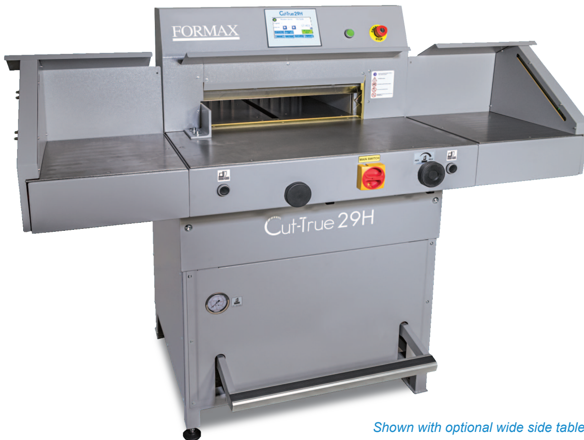
Shown with optional wide side tables

The Formax Cut-True 29H Hydraulic Guillotine Paper Cutter offers precision cutting for paper stacks up to 20.5" wide. User-friendly, intuitive features include a 7" full-color touchscreen control panel, automatically-adjusting back gauge and the capacity to program up to 100 jobs/100 cuts . An infrared light beam safety curtain provides safety and convenience as it shuts down operation if the light plane is interrupted.