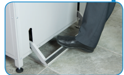
Foot pedal pre-clamp holds paper to check alignment prior to cutting