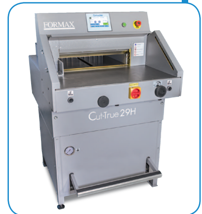
Standard model, without side tables