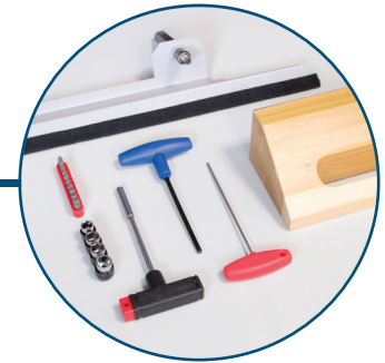
Blade Change Safety Tool Kit Change blades safely and easily, and make adjustments