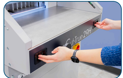
Two-Hand Operation for Safety Automatically engages clamp and blade, keeping hands away from the cutting area