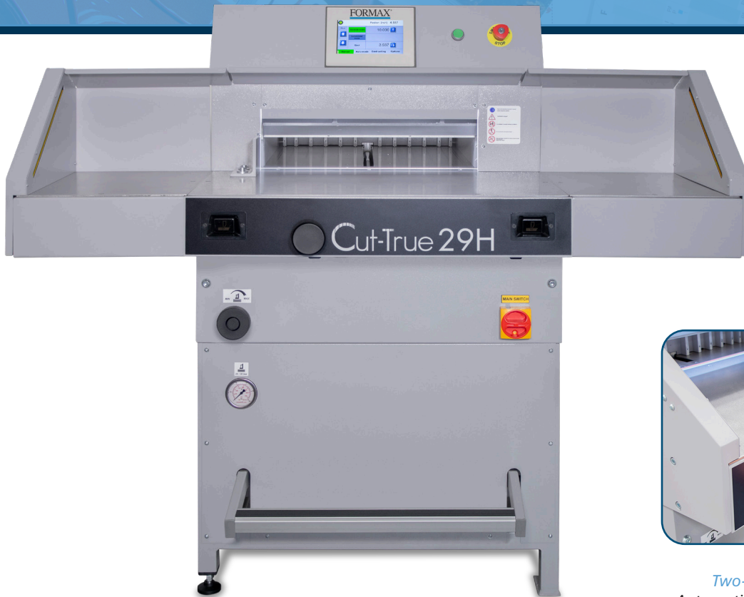
Shown with optional wide side tables