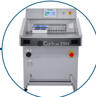
Standard Model Compact model without optional side tables