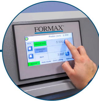
Touchscreen Control Panel Allows for programming up to 100 jobs and 100 steps