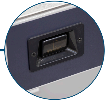
User-Friendly Design Ergonomically designed buttons for long-term operator comfort