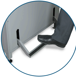
Foot Pedal Pre-Clamp Holds paper to check alignment prior to cutting