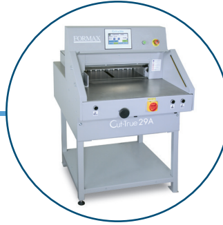
Standard Model Shown without side tables