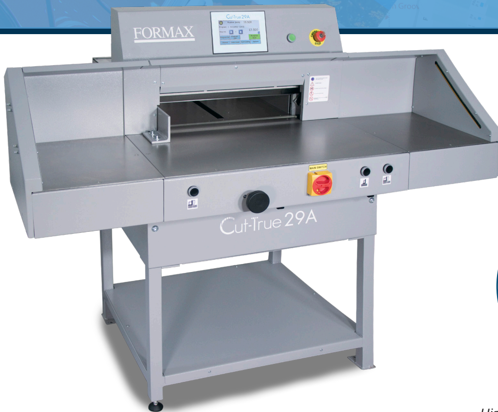
Shown with optional wide side tables