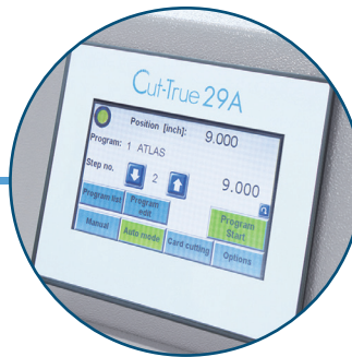
Touchscreen Control Panel Program jobs, switch between inches/mm, paper eject function, programming via cutting & more