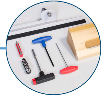
Blade Change Safety Tool Kit Change blades safely and easily, and make adjustments