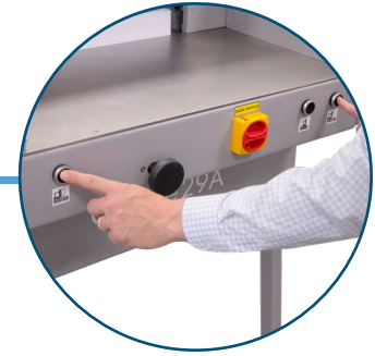
Two-Hand Operation Automatically engages clamp and blade, keeping hands away from the cutting area