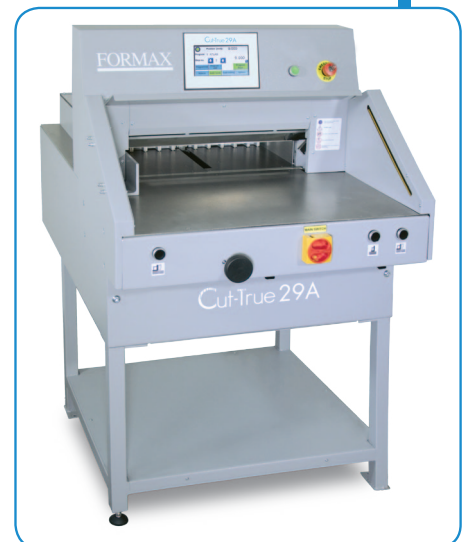
Standard model, without optional wide side tables

Formax – New Hampshire, USA www.formax.com