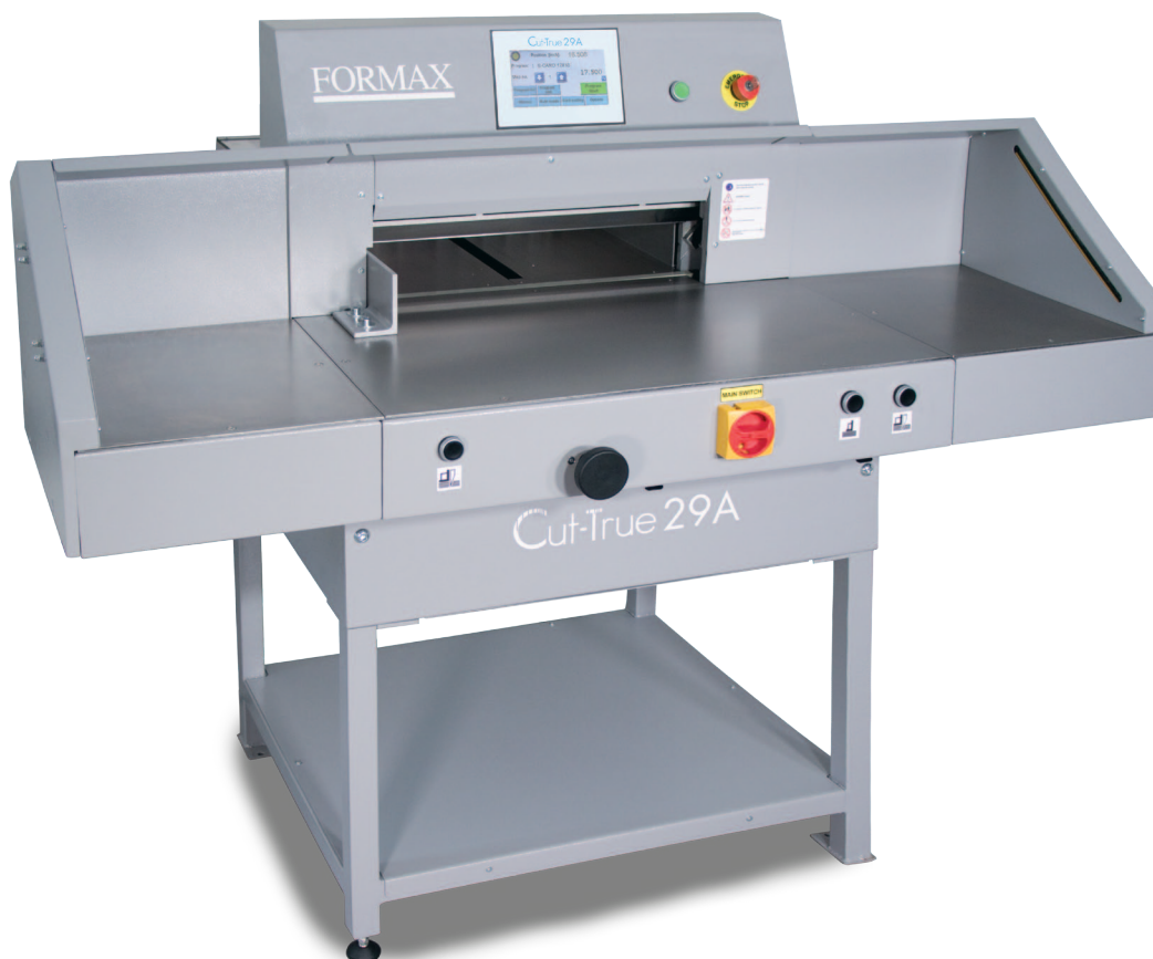
Shown with optional wide side tables

The Formax Cut-True 29A Electric Guillotine Paper Cutter offers precision cutting for paper stacks up to 20.5" wide. User-friendly, intuitive features include a 7" full-color touchscreen control panel, automatically-adjusting back gauge and the capacity to program up to 100 jobs/100 cuts . An infrared light beam safety curtain provides safety and convenience as it shuts down operation if the light plane is interrupted.