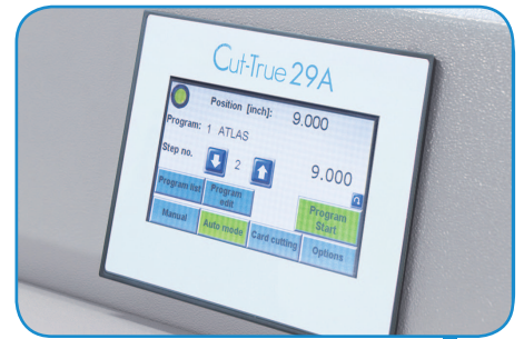
Full-color touchscreen control panel allows for programming up to 100 jobs

* 31"W with safety curtains removed for easier transport through doorways. 33.5"W including safety curtains.