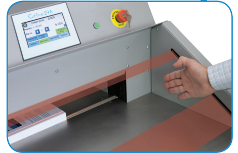
Infrared Safety Curtain shuts down operation if the beam is interrupted