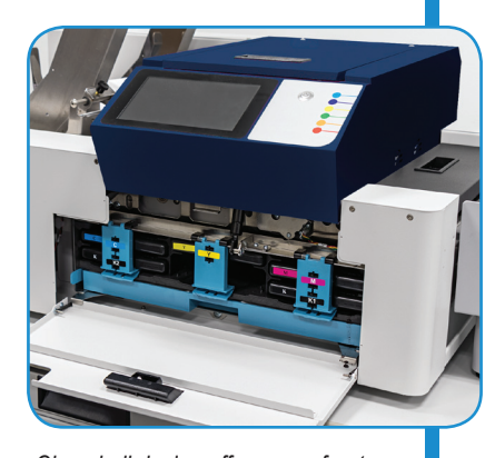
Clamshell design offers easy front access to ink tanks and paper path