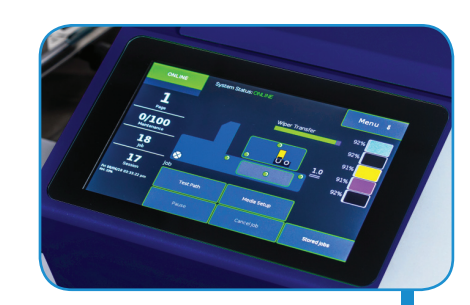
Intuitive 7" color touchscreen displays system status, image preview, and provides access to stored jobs